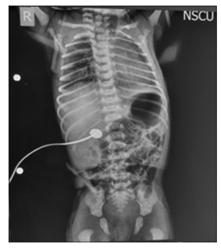
Figure 1: Pre-operative chest x-ray showing coiling of nasogastric tube and non-expansion of left lung.